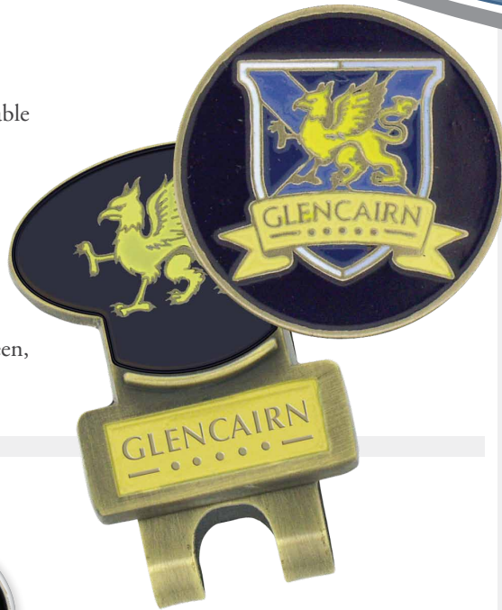
Custom Troon #36.3HC11C