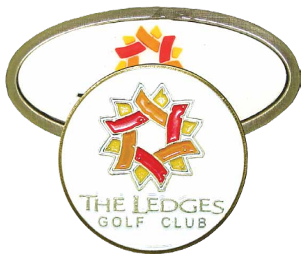
Wellington with Ball Marker

The Wellington hat clip contains a PVC oval insert that can be branded with your logo. The recessed magnet is small but powerful enough for any ballmarker. Can be ordered with or without ballmarker.